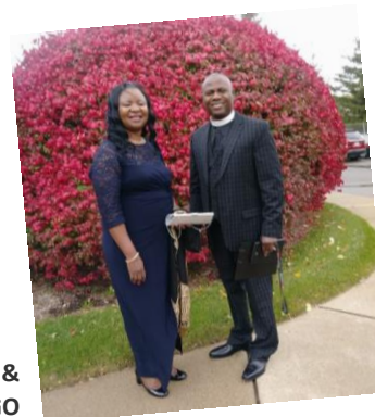
OPIRA, MICHIGAN & CONGO