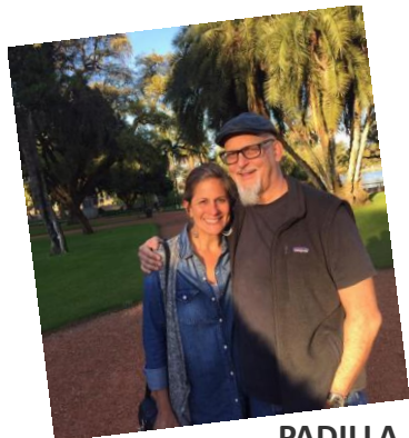
PADILLA-DEBORST, CENTRAL AMERICA