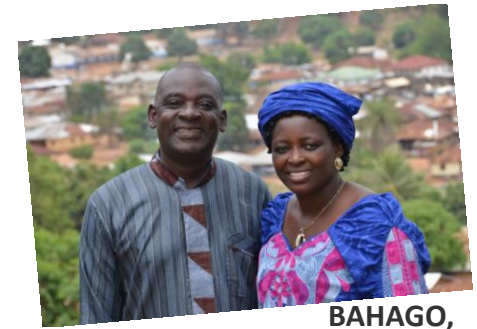
BAHAGO, SIERRA LEONE