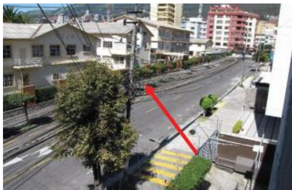
Geoff's commute to work

COS missionaries are facing changed schedules, anxiety, and isolation. Uncertainty – but also hope. In their own words: